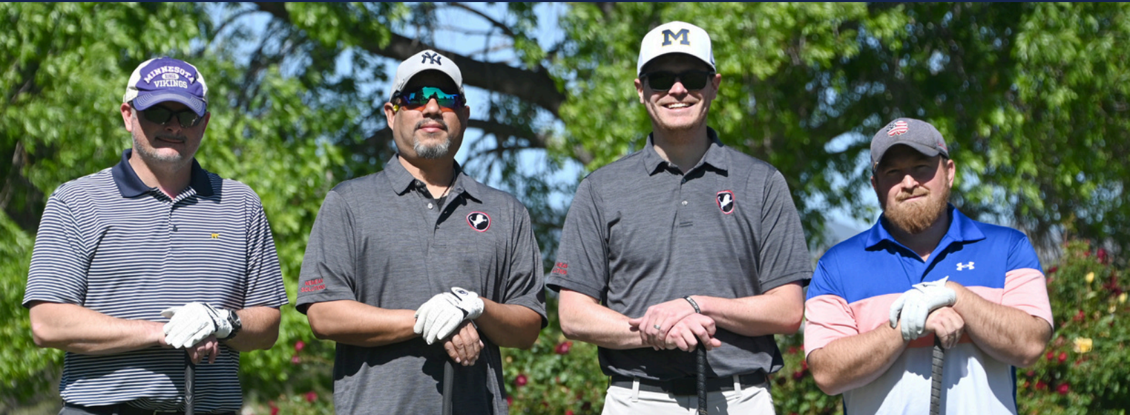
Nemean Solutions Team