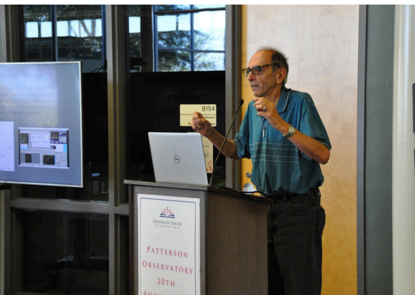
Dr. David H. Levy Astronomer, Comet Discoverer

On September 5, 2024, Patterson Observatory celebrated its 20th anniversary, marking two decades of dedication to astronomy, education, and public engagement.