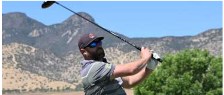
Players enjoyed warm and breezy weather against the scenic backdrop of the Huachuca Mountains