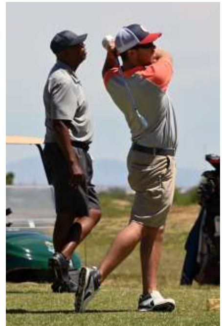
Sulphur Springs Valley Electric Cooperative (SSVEC) team with a nice swing. SSVEC sponsored $2,500 in scholarships for Cyber students, and an additional $15,000 in scholarships for SSVEC members in 2022.