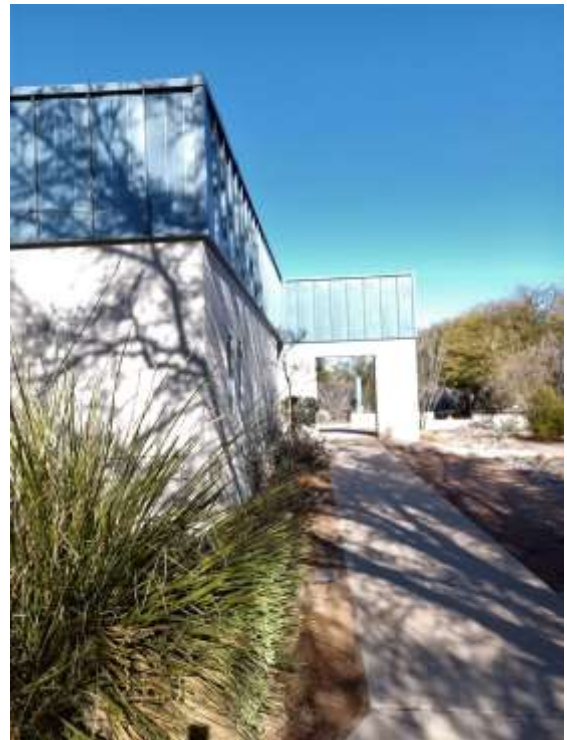
Groth Hall painting and roof repair was completed in 2022

Computer servers need a dedicated cooling unit in order to keep the electronic components performing at their optimal level. The air conditioning split unit for the server room in Groth Hall failed suddenly, and the foundation was able to hire a trusted local vendor and have it replaced quickly.